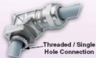
Threaded / Single Hole Connection